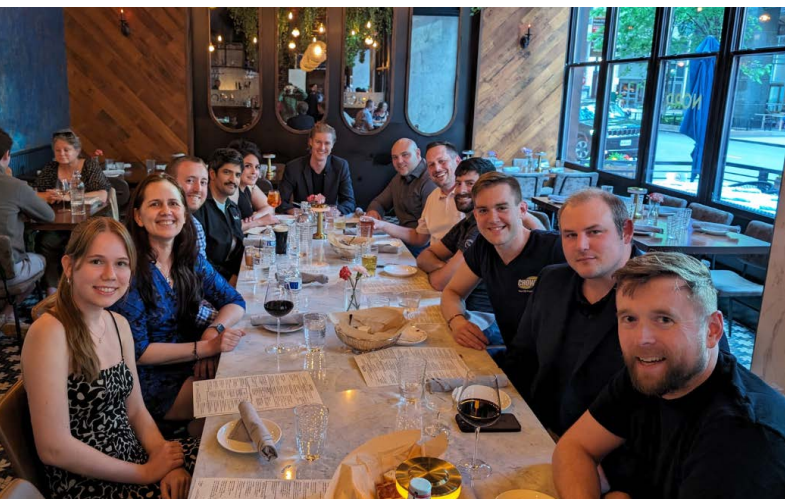
Chowly team dinner at Nora Restaurant & Bar